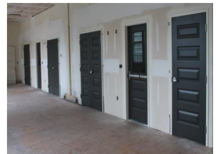
New doors in the Earnshaw Room

Additionally, we have many opportunities for sponsoring special projects in the building, such as the audio-visual system, the restoration of the original blackboard or schoolhouse lights, a moveable divider or moveable stage for the Earnshaw Room, the sign over the front entrance, or a coffee station for the reception area. We have lots of suggestions so please don't hesitate to contact us for more information at the Bedford Historical Society by going to https://bedfordhistoricalnh.org/stevens-buswell-community-center-bedford-nh/ on our beautiful new website! As always, donations of any size are appreciated. Please reach out to us if you would like to join our committee to help get us to the finish line with Bedford's community center project!